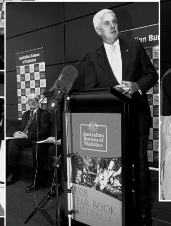
His Excellency, the Governor-General of the Commonwealth of Australia Sir Michael Jeffery.